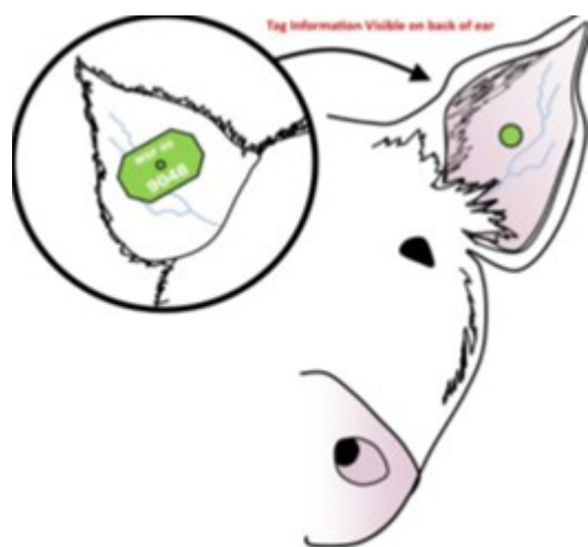
SWINE EAR TAGGING

*****FFA members (Showing animals in FFA, other than beef). You will still need to complete manual nomination forms and submit with pictures as described above by the stated deadlines to coopext.lincoln@mail.colostate.edu . The forms are available on the Extension website @ lincoln.extension.colostate.edu/4-h-forms-applications/ under tab "fair related".